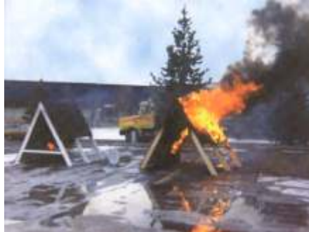
SafeCoat coated interior roof space and an untreated roof space under identical fire conditions

SafeCoat can be applied to many types of surfaces. It is used by many manufacturers in their products or systems. Whether ASTM, UL, CSA, NFPA or other codes, SafeCoat can help you meet code requirements.